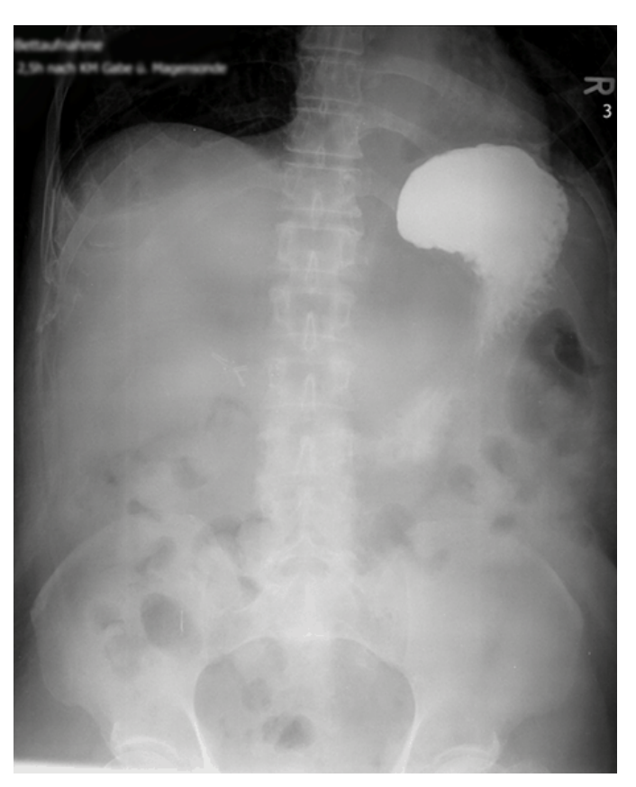
Figure 2: Abdomen X-ray showing evidence of a gastric obstruction after administration of 100 ml gastrografin 2.5 h