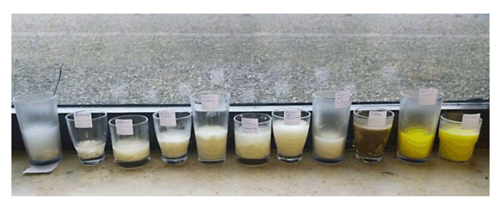
Figure 4: In vitro serial dilution concerning the semiquantitive analysis of dissolution strategies for gastric lactobezoars showing citric acid and parts of the gastric lactobezoar in question after 48 h at room temperature.

reported since 1975 [7, 8]. Gastric lactobezoars differ from other bezoars most notably by the age of presentation. The majority of gastric lactobezoars have been reported in infants and small children. Most cases deal with ageinadequate malnutrition often associated with cow's milk [9]. Dehydration and formulas high in medium chain triglycerides, casein and caloric densitiy are common contributing factors towards the pathogenesis of gastric lactobezoars [10].