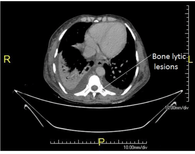
Figure 2: Computed tomography scan of thorax showing lytic lesions in vertebra.

enlarged kidneys and 24 hour urine protein levels of 514 mg/dl renal biopsy was performed which was positive for amyloid. Patient was started on a bortezomib/ melphalan/ prednisolone based regimen but succumbed due to cardiac failure during chemotherapy with in a few weeks.